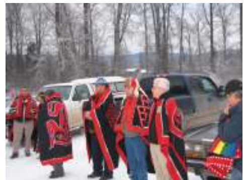
Gitksan Hereditary Chiefs in Moricetown