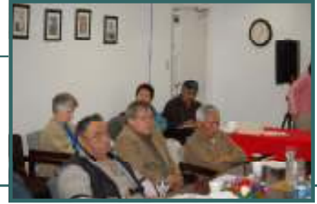
Meeting on June 20, 2006