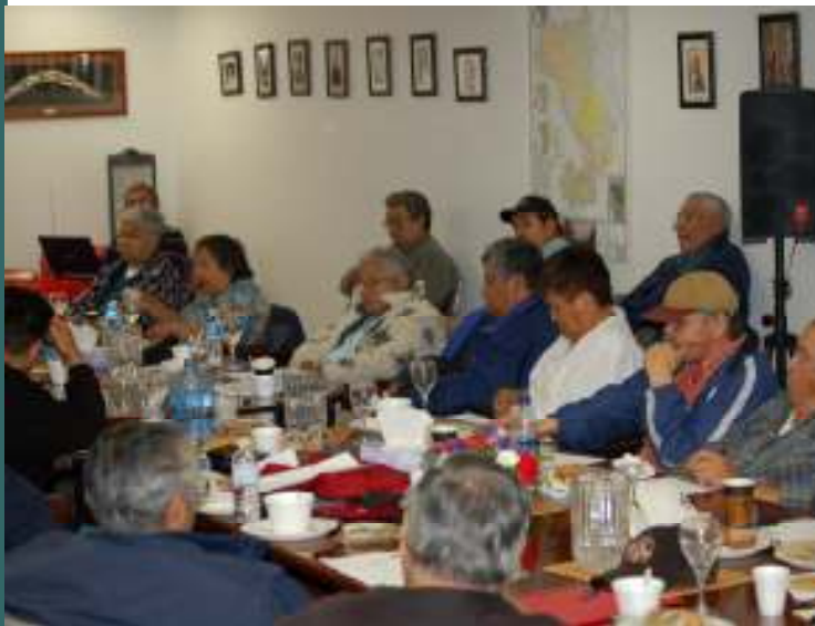
License purchase Meeting on June 20,2006

sion. In this meeting SWFP stated they are not interested in getting into the logging business, they are only interested in purchasing the fibre from the licensee. The Gitxsan are currently negotiating the purchase of the old Carnaby Forest License. Should the Gitxsan be successful in the purchase of the License they will have control over the planning and management of the forest license area. The purchase will also open the door to new economic ventures for all Gitxsan and non-Gitxsan entrepreneurs.